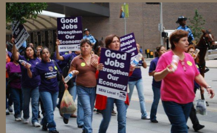
We are asking Houston business leaders to advocate for janitors